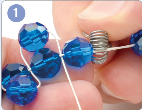
1 Squeeze ends of bead stopper to open.