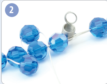
2 Clamp onto bead cord to start and hold beads in place.